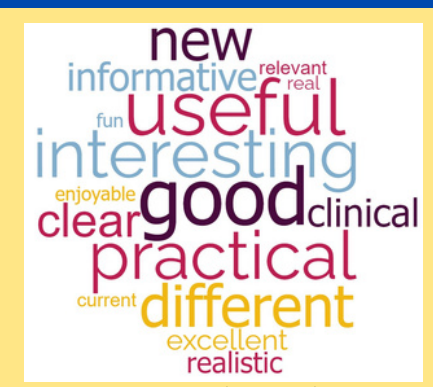
Figure 2: A word cloud illustrating the most popular adjectives used to describe the May 2024 course on feedback forms

Figure 3 shows the delegates' average reported increase in confidence in their knowledge of sedation and ability to plan a safe sedation plan after having completed the course.