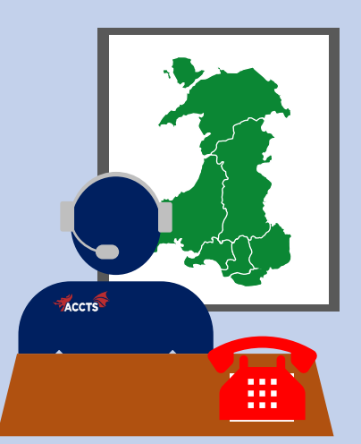
Coordination & logistics of critical care transfers

Aortic balloon pumps, mechanical support & cardiogenic shock