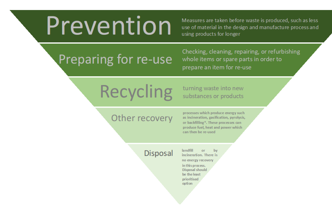
Figure 1: Waste hierarchy [*Gasification - reaction of waste with oxygen and/or steam, resulting in the production of carbon monoxide, carbon dioxide, and hydrogen. Pyrolysis - process of heating organic substances to above decomposition temperatures resulting in production of char and eventually ash. Backfilling - reclaiming excavated areas for landscaping purposes using non-hazardous waste as a substitute for non-waste materials.<sup>11</sup>

The waste hierarchy was produced by DEFRA and the Environment Agency in response to The England & Wales Waste Regulations 2011. It ranks waste management options in order of what is best for the environment. These options are based on current scientific research e.g. climate change, air and water quality. New technologies may emerge which improve the efficiency of waste management and therefore the hierarchy. See figure 1. Every industry has a legal duty of care to take all reasonable steps to apply the hierarchy to all waste produced from top to bottom.