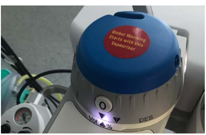
Figure 1: simple visual reminders can be a powerful form of departmental advocacy