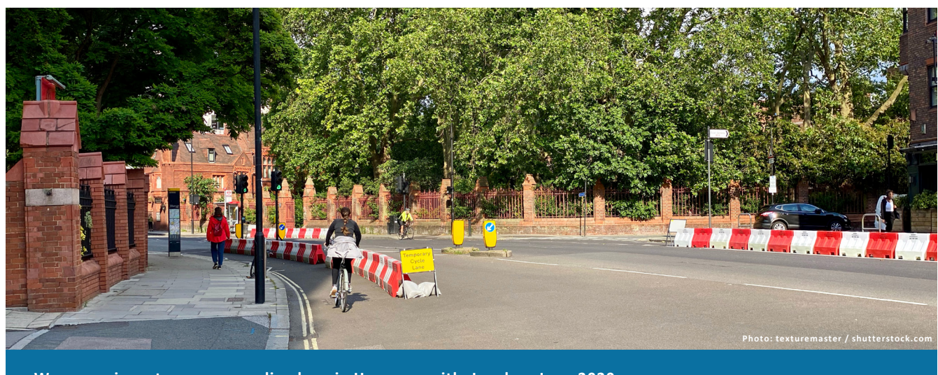
Woman using a temporary cycling lane in Hammersmith, London, June 2020.

Planning in order to adapt to future climate-related threats is also necessary to protect health. Of 14 UK cities surveyed, 10 had completed or initiated a city-level risk assessment in 2019. Extreme heat, heatwaves and flooding were the most commonly identified hazards affecting public health. The negative health impacts of heatwaves as they are projected to increase in frequency and intensity will be particularly pronounced in cities due to the urban heat island effect. Over 8,000 people aged over 65 died in the summer heatwaves of 2018. Adaptation in cities will be especially important to reduce this mortality.